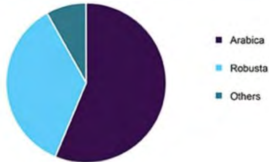
Global decaf coffee market share, by bean species, 2019 (%)